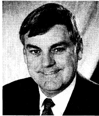
Mr Bruce Jeffery, M.P. National Party Whip and Member for Oxley